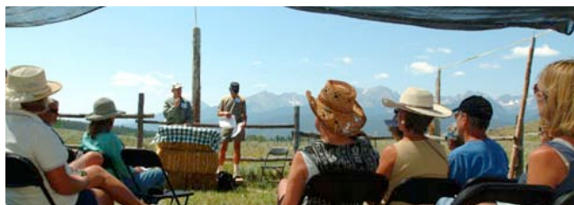
Sun hats galore gathered for the July 30th meeting .....LEFT

If you are committed to fire mitigation and reforestation, then contact Sam Kirk at samkirk@wildblue.net (or 468-2649) to arrange for a speakers' panel, individual consultation with a wildfire or forest expert, or a meeting with the USFS.